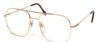
SNOOKER 21665127 2 pairs single vision $299