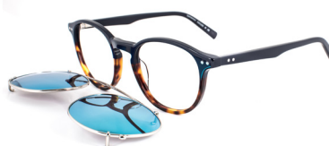
Lewisham 30690745 2 pairs single vision $459

STYLE TIP: TORTOISE-SHELL GLASSES ARE A GREAT CHOICE FOR THE SEASON BECAUSE THEY CAN BE CARRIED EFFORTLESSLY INTO YOUR WINTER WARDROBE.