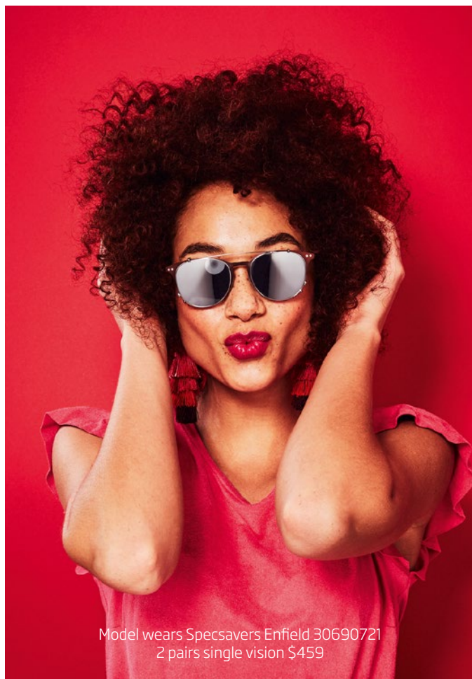
Model wears Specsavers Enfield 30690721 2 pairs single vision $459

Check out our clip-on combination frames, set to transform your glasses into prescription sunglasses instantly to give you two looks in one pair.