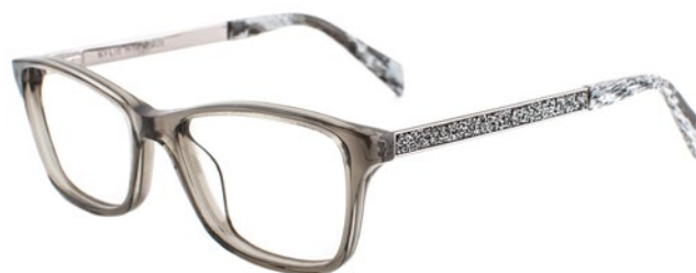
KYLIE 08 30520219 2 pairs single vision $459

As an alternative to classic black, translucent frames offer a subtle approach that will soften up your look. These translucent styles are a perfect option as the days become warmer and your wardrobe becomes lighter.