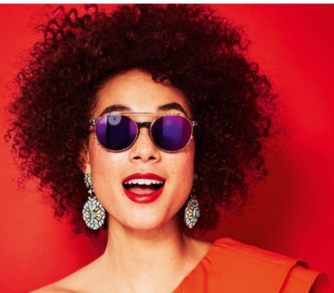
Model wears Specsavers Harrow 30690691 2 pairs single vision $459