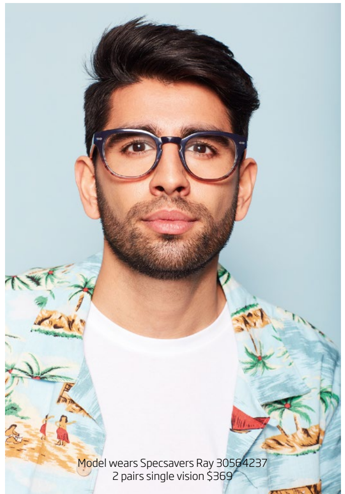
Model wears Specsavers Ray 30564237 2 pairs single vision $369

STYLE TIP: ROUND FRAMES HAVE HAD A HUGE RESURGENCE IN POPULARITY. THEY SOFTEN ANGULAR, SQUARE OR OBLONG FACES AND ALSO SUIT HEART-SHAPED FACES. PAIR THESE GLASSES WITH SOME THRIFT-STORE FINDS AND YOUR VINTAGE-INSPIRED OUTFIT WILL BE COMPLETE.